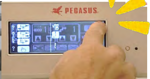
Touch panel operation